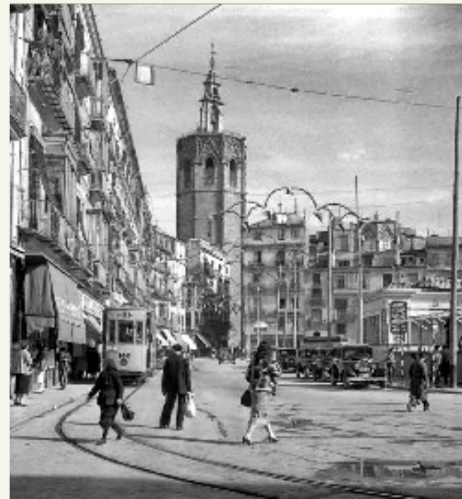
IMG. 01 PLAZA DE LA REINA, VALENCIA

Born and proud in Valencia, we commit to entirely local production. All our fabrics are woven in the Valencian Community, using Jacquard looms by industry professionals. Likewise, we craft our garments to maintain the highest quality and care.